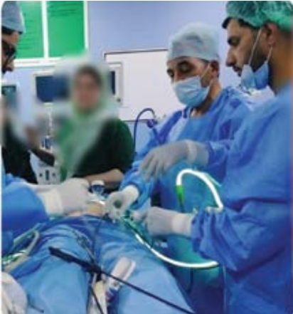
He said the entire OT staff played a pivotal role in ensuring the smooth and successful execution of the surgery.