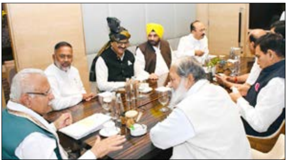
Javed Rana urged for upgradation of Kishenpur-Moga transmission line and completion of the 400 KVA Grid Station at Siot to ensure reliable power supply to the region.

Sakeena Itoo greets people on auspicious occasion of Eid-ul-Adha Convener News Desk SRINAGAR: Minister for Health and Medical Education, Social Welfare and Education, Sakeena Itoo has extended her heartfelt greetings to the people of Jammu and Kashmir on the auspicious occasion of Eid-ul-Adha. In her greetings, Minister Sakeena said that Eid-ul-Adha, the Festival of Sacrifice, is not only a celebration of faith and devotion but also a time to reaffirm our commitment to compassion, humility, and unity. She added that Eid is a day that commemorates the unparalleled obedience and submission of Prophet Ibrahim (A.S) to the will of Almighty Allah, a lesson that inspires us to lead lives of sincerity, selflessness and service to humanity. "As we gather in prayer and offer our Qurbani (sacrifice), let us also remember the values this festival upholds – caring for the underprivileged, sharing our blessings, and strengthening the bonds of community and kinship. It is a time to embrace those in need with empathy and ensure that no one is left behind in our collective celebration", Sakeena said. The Minister also called upon all to celebrate this Eid with a renewed sense of responsibility towards each other and with prayers for peace, prosperity, and harmony in our region and across the world. She also prayed for everyone contributing towards building a more inclusive, enlightened and resilient Jammu & Kashmir. (DIPR)