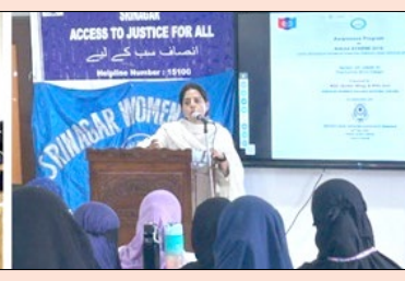
programmes are vital to building informed and empowered communities, especially

in disaster-prone regions. She noted that bridging legal knowledge with academic spaces strengthens the social fabric by ensuring students and citizens are aware of the support systems available to them.