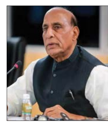
struck several terrorist bases in Pakistan and Pakistan-occupied Kashmir. Drawing a comparison between the

Addressing an event on the occasion of the 25th anniversary of KN Memorial Hospital, Singh said, "Our forces acted just like expert doctors or surgeons. A surgeon uses his instruments precisely where the disease lies, and the Indian forces have done the same – striking at the root of terrorism with unmatched precision." This was Singh's first public appearance since the May 7 Indian military operation that