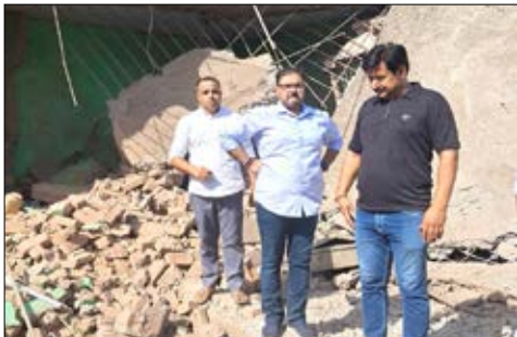
and assured all affected families that the government

JAMMU: Minister for FCS&CA, Transport, Science and Technology, Satish Sharma, today visited several villages affected by recent cross border shelling to assess the damage and extend support to the affected families. During the visit, the Minister met with the residents whose homes and livelihoods have been severely impacted. A preliminary assessment indicated that numerous households have suffered losses, including damage to residential structures and loss of livestock. The villages visited by the Minister included Kot Maira, Chaprial, Pahariwala, Panjtoot, Narayana, Dhaleri and other adjoining areas. The Minister expressed deep concern over the situation