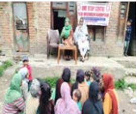
Special emphasis was laid on the significance of the 181

assistance provided by OSC including legal aid, psychological counseling, temporary shelter, and police facilitation.