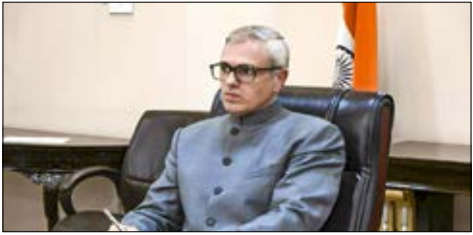
thinks the current tension in the subcontinent will be

Srinagar: Chief Minister Omar Abdullah on Saturday hit out at the IMF for granting a billion dollar loan to Pakistan, saying the global financial organisation was "essentially reimbursing" Islamabad for the ammunition used to devastate border areas of the Union territory. The International Monetary Fund on Friday approved the disbursement of around USD 1 billion to Pakistan under the Extended Fund Facility (EFF). "I'm not sure how the 'International Community' thinks the current tension in the subcontinent will be