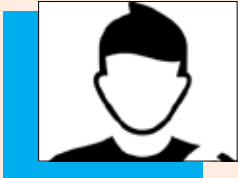
FIRDOUS AHMAD MALIK

There's also a critique regarding Ansary's somewhat idealized portrayal of the early periods of Islamic civilization. While the golden age of Islamic science, art, and philosophy is rightly celebrated, some critics suggest that Ansary occasionally glosses over the internal conflicts, contradictions, and struggles that were present in Islamic societies, especially during periods of decline or stagnation. For example, the complex relationships between religious scholars, political leaders, and military rulers during times of fragmentation or conquest are not always fully addressed, which could offer a more balanced view of Islamic history.