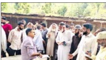
Addressing the prevailing security concerns in the aftermath of the recent Pahalgam