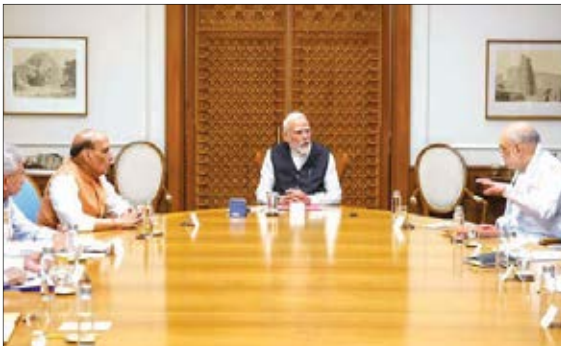
Kashmir. The meeting chaired by Prime Minister Narendra Modi was attended by Home Minister Amit Shah, Defence Minister Rajnath

The meeting of the Cabinet Committee on Security was held at the Prime Minister's residence in New Delhi over the terror attack at Pahalgam in Jammu and