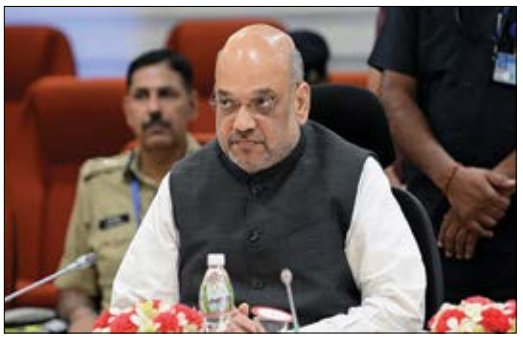
KC News Network

NEW DELHI : In the wake of killing of eight Naxals by security forces in Jharkhand, Union Home Minister Amit Shah on Monday asserted that his government's commitment to eliminate Naxalism continues unabated.