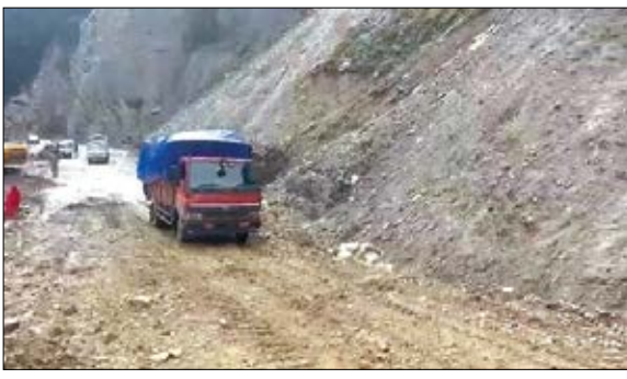
KC News Network

RAJOURI: As the landslidehit Jammu-Srinagar National Highway remained shut for a second consecutive day on Monday, the reopening of the Mughal Road connecting the twin border districts of Rajouri and Poonch in Jammu to south Kashmir's Shopian district brought huge relief to the stranded