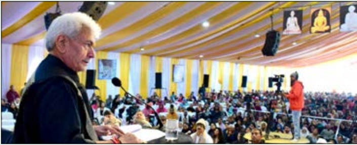
ethical and moral values. Lord Ram's life values hold immense power for