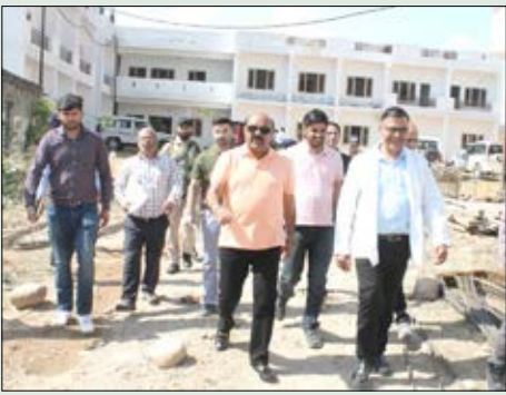
of Rs 2.64 crore. It was also informed that all the works

It was informed that Boys hostel has been sanctioned with an estimated cost of Rs 6.39 crore while girls hostel has been approved with an estimated cost of Rs 6.50 crore and an additional new block in Nursing College has to be completed with an estimated cost