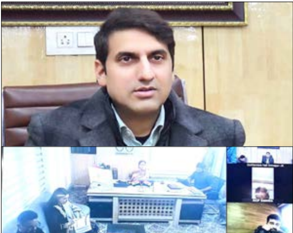
for achieving the goals of Swachh Bharat Mission (Gramin) and improving rural sanitation across J&K.