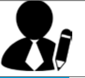
By: Tawheed Parvaiz Bhait

In the 21st century, the world has transitioned from a global village to a global mahallah, where connectivity is no longer a luxury but a necessity. This transformation has been made possible by the vast and intricate web of the internet, which has brought even the most remote corners of the world under a single digital umbrella.