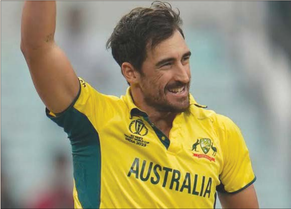
15-player squad that will be captained by Steven Smith. Australia had already been forced into

Australia Champions Trophy squad Steve Smith (capt), Sean Abbott, Alex Carey, Ben Dwarshuis, Nathan Ellis, Jake Fraser-McGurk, Aaron Hardie, Travis Head, Josh Inglis, Spencer Johnson, Marnus Labuschagne, Glenn Maxwell, Tanveer Sangha, Matthew Short, Adam Zampa