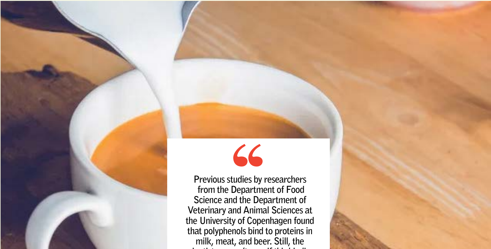
effects in humans.

The study authors note that they plan to explore these findings further using animal studies. Then, they hope to secure funding to continue investigating the