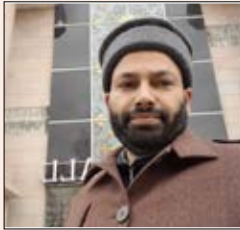
Shabeer Ahmad Lone

4. The collection’s paradoxical nature is most striking when it explores the tension between personal desire and societal imposition. In Once Upon a Time , Raina contrasts the unwavering pursuit of ideologies—whether left-wing or right-wing—with the human tendency to resist such impositions through personal will and soul. The depiction of the “Left” as the “reasoning fool” and the “Right” as the “focused Ninja” critiques political extremism, painting it as narrow and blind to deeper currents of humanity. This critique finds resonance in Democracy , where Raina explores the systemic failures of political systems that perpetuate division and violence, failing to serve the people’s best interests. Badri Raina’s poetry grapples with the contradictions of human existence—ideological rigidity versus personal freedom, oppression versus resistance. Once Upon a Time critiques political extremism, drawing parallels with Orwell and Arendt’s analysis of totalitarianism. Democracy and The Beating of Drums expose systems that divide and oppress, resonating with Marx and Fanon’s critiques of power.