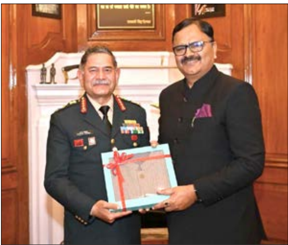
The meeting emphasised the importance of mainstreaming