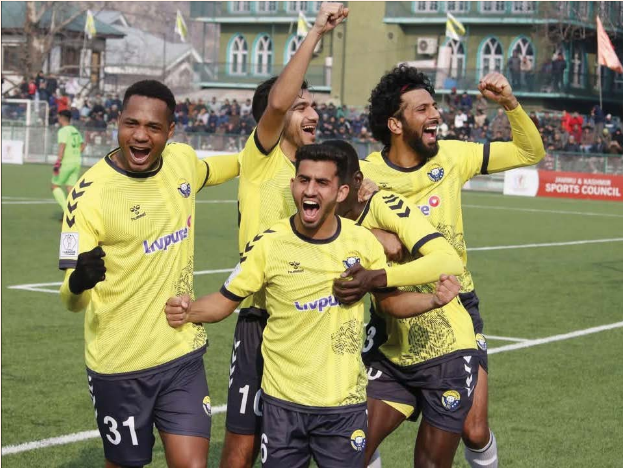
SRINAGAR: After delivering an excellent performance against Sporting Club Bengaluru in their previous game, Real Kashmir Football Club (RKFC) is set to face Dempo Sports Club Goa in an I-League match on Sunday (January 26) at the TRC Ground, Srinagar.

The match is scheduled to start at 2 PM, with adequate arrangements made by the team management, police, and other administrative departments.