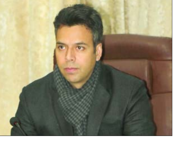
and wee hours for the devotees during the auspicious days of Merajun-Nabi(SAW) and make availability of e-Rickshaws from parking slots

To ensure adequate availability of transport facility, the RTO was asked to make better transport arrangements particularly during night