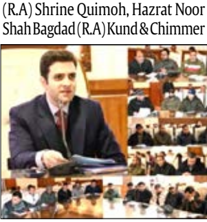
(RA) Shrine Quimoh, Hazrat Noor Shah Bagdad (RA) Kund & Chimmer as a precautionary measure. The Assistant Director, FCS&CA was directed to make available essential commodities in all the food stores, ensuring quality of all essentials. All the Executive Officers of three Municipal Committees were directed to clean up the surroundings of all major shrines in the district. Tehsildars were directed to intensify the market checking and