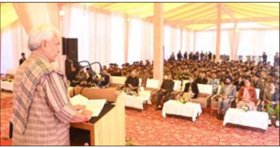
transformational journey of North Eastern States, under the leadership

JAMMU: The Foundation Day of Meghalaya, Manipur and Tripura was celebrated in J&K Raj Bhavan. Students, Security personnel and the people of Tripura, Meghalaya and Manipur living in J&K were the special invitees for the cultural programme celebrating the spirit of Ek Bharat Shreshtha Bharat, organized to commemorate the occasion. In his address, Lieutenant Governor Shri Manoj Sinha conveyed his hearty greetings and best wishes to the people of Tripura, Meghalaya and Manipur. He paid homage to the great personalities of the three states and remembered their significant contribution in nation building. The Lieutenant Governor also spoke on the socio-economic