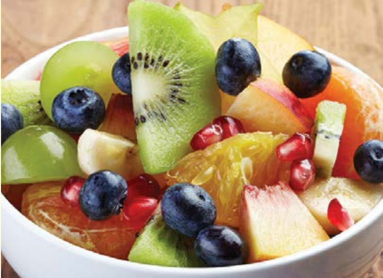
increased risk of experiencing serious symptoms once infected, the impact of diet on these risks is unknown.

WASHINGTON: In a recent study led by researchers at Massachusetts General Hospital (MGH) and published in Gut, people whose diets were based on healthy plant-based foods had lower risks on both counts. The beneficial effects of diet on COVID-19 risk seemed especially relevant in individuals living in areas of high socioeconomic deprivation. Although metabolic conditions such as obesity and type 2 diabetes have been linked to an increased risk of COVID-19, as well as an