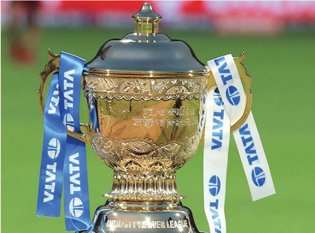
The BCCI has also decided to add two new venues for the WPL. Along with Mumbai and Bangalore, the WPL will also be played in Baroda and Lucknow this year. The exact number of matches at each venue is not known as the WPL schedule is not yet out.

The 2025 season will comprise 74 matches, the same as the last three seasons. That number, though, is ten less than the 84 matches listed by the IPL in 2022 when the media rights for the 2023-27 cycle were sold. In the tender document for the new rights cycle, the IPL had listed a varying number of matches per season: ranging from 74 games each in 2023 and 2024, 84 matches each in 2025 and 2026, and a maximum of 94 games for the final year of the deal in 2027.