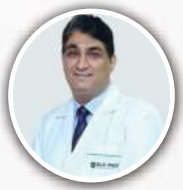
DR. PUNEET GIRDHAR

Neuromuscular scoliosis is a complex spinal deformity that develops due to various neurological or muscular conditions. It primarily affects individuals with conditions such as cerebral palsy, muscular dystrophy, spina bifida, spinal cord injuries, and neurofibromatosis. This guide aims to provide a comprehensive overview of neuromuscular scoliosis, including its causes, progression, treatment options, and the risks associated with untreated severe deformities.