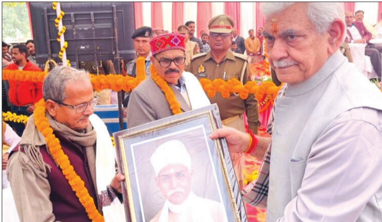
the idea of self-reliant, modern and united India. The vision of Mahamana had opened

"Mahamana's relentless pursuit to public welfare and nation building had shaped