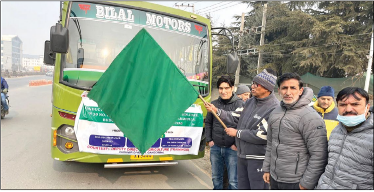
crops on scientific lines. He said skilled human resource and capacity building of farmers are among the department's priorities.

The Director, while interacting with the farmers on the occasion, said that the training program has been organised for making the farmers aware of the latest technologies for commercial farming, realtime trends in farming and cultivation of different agriculture