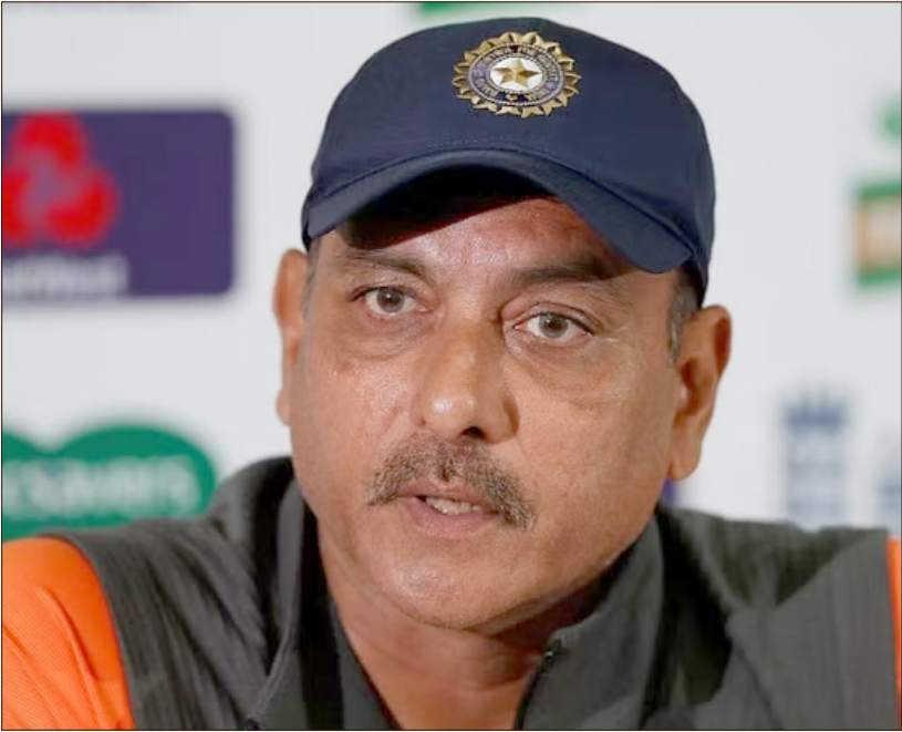
Australia." Shastri feels McSweeney was unfortunate But I think it's a good move getting Konstas in because you need someone who can

take the attack to the Indian team, because the punches were coming from nowhere." India have won the last two series in Australia and now have the opportunity to become only the third touring side to win three consecutive series Down Under, joining the West Indies (1984/85, 1988/89, 1992/93) and South Africa (2008/09, 2012/13, 2016/17). "Massive. No team has done that in a long time. Australia hammers sides when they come here. For India to pull off three on the trot will be something special. "But they'll have to play good cricket. I see Australia coming hard in this Test match, especially with the bowlers. It's the batting that'll be the challenge for Australia more than anything else." Shastri feels India has come to Australia with a strong intent to win. "India have come here to win, they haven't come here to fill in the numbers. Even when I was the coach, our mantra was to play extremely hard, fair and to win. "You have to think of a method to beat Australia and not just compete. You've got to plan properly, how to take your 20 wickets. India have done that and been very aggressive. "They've been in the face of Australia and give as good as they get. It's been entertaining and feisty stuff. The first day of the Boxing Day Test will determine which way the series will go," he added.