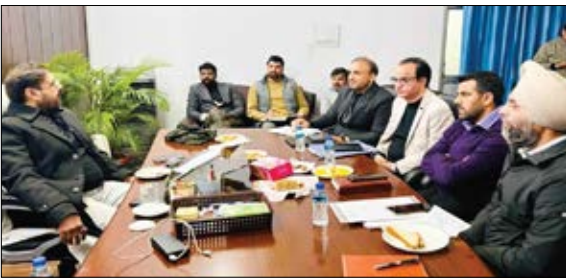
Balli and Khour. He laid stress on convergence with other departments in building community developmental assets. Highlighting the importance