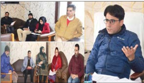
emphasized the importance of teamwork and urged staff to