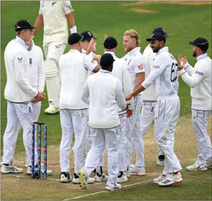
Latham ceding his side were unable to cope with the pressure they were put under by after winning the opener at Hagley Oval by eight wickets.

Ben Stokes has credited England's "more dominant cricket" for securing their first series win in New Zealand since 2008, with Black Caps captain Tom