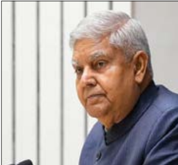
JMM, the AAP, the DMK — have signed the notice.